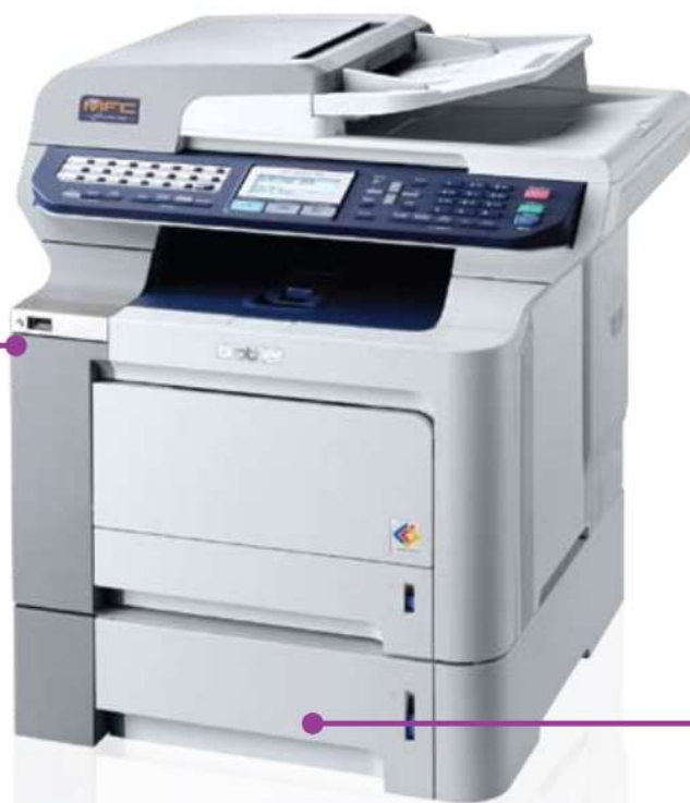
MFC-9840CDW (with optional lower tray)