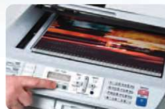
Scanning made simple via the machine control panel