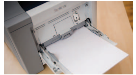
Multi Purpose Tray Print envelopes and labels using the multi purpose tray

Combining professional duplex colour laser print, copy and scan functions together in one compact networked machine.