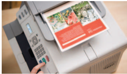
Automatic Document Feeder For easy copying of multi-page documents