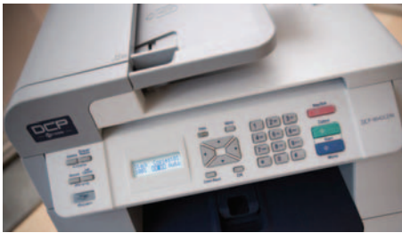
Stylish, user-friendly design Control panel designed to maximise usability