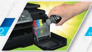
STEP 2 Refill ink tank. Remove tank cap. Tilt ink bottle at 45° angle and gently squeeze it to refill ink tank.