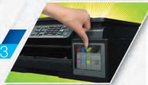
STEP 3 You're done! Replace cap and close cover. It's that easy!

What's amazing about the the new Brother Inkjet Multi-Function Centre series design is how it takes the hassle out of ink refill.