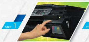
STEP 1 Open cover. Accessing ink tank is so easy with the cover right in front.