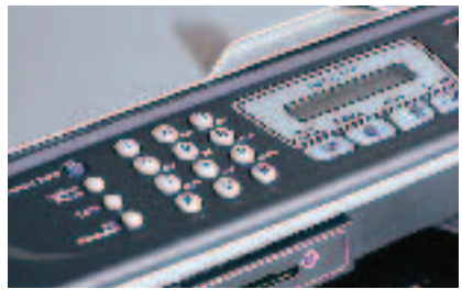
20 Speed dials and a 170 page fax memory

Stylish and simple to use, this is a machine that not only looks good it also offers remarkable value to business users.