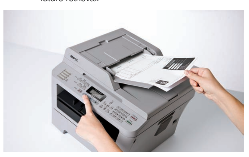
Scan, copy and fax multipage documents easily with the 35 sheet ADF

The MFC-7362N comes complete with a range of easy-to-use software utilities to improve your productivity. Bundled with the powerful Scansoft® Paperport™ document management software, hard copy documents such as invoices can be scanned, stored and managed electronically for future retrieval.