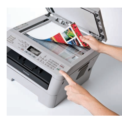
Scan colour documents direct to your PC