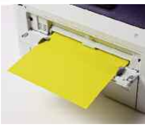
Print on thick paper or envelopes.

Discover Brother's Top Ten easy to use solutions to cut costs, get organised and save time in the office.