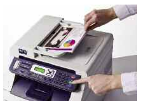
Automatic Document Feeder - ideal when faxing, copying or scanning multiple page documents.