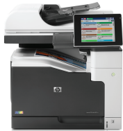
HP LaserJet Enterprise 700 color MFP M775dn

Enable large-volume, professional-quality color printing on a wide range of paper sizes—up to A3—with paper capacity up to 4,350 sheets. 1 Preview and edit scanning jobs. Centrally manage printing policies. Safeguard sensitive business information.