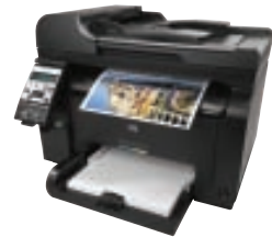
HP LaserJet Pro 100 Colour MFP (M175nw)

Produce professional-quality colour at the office, and easily print, scan and copy, using HP's smallest colour laser MFP. You can count on HP to deliver innovations that make it easy to print from any mobile device and to reduce energy use 1,2,3 .