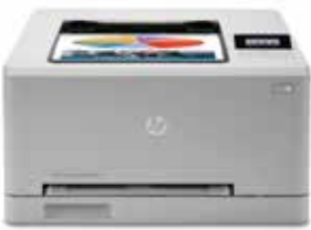
HP Color LaserJet Pro M252n

In today's fast-paced business environment, you need technology that can hit the ground running. This compact printer, combined with Original HP Toner with JetIntelligence, helps meet the needs of your business—and is ready to work when you are.