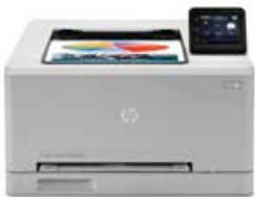
HP Color LaserJet Pro M252dw