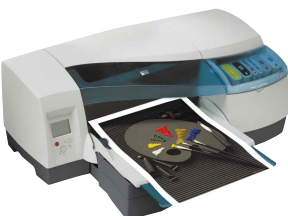
hp designjet 20ps printer