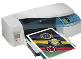
hp designjet 10ps printer

*HP remote proofing solution will be available at the beginning of 2002