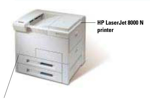
10/100Base-TX HP JetDirect 600N Internal Print Server

In addition to all the features found on the HP LaserJet 8000 printer, the HP LaserJet 8000 N also comes with: