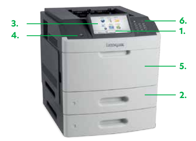
M5163 model with 10.9 cm (4.3-inch) colour touch screen and additional 550-sheet tray